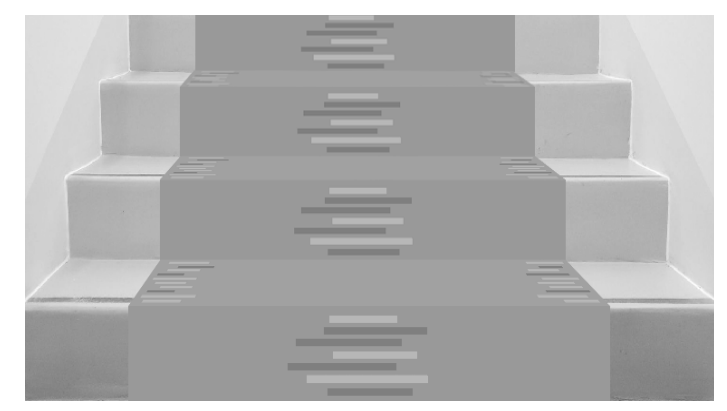
MODEL STAIRCASE SHOWN Max width 10'